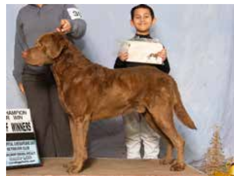
“Snickers” CH Redlion’s Fun Size Snickers