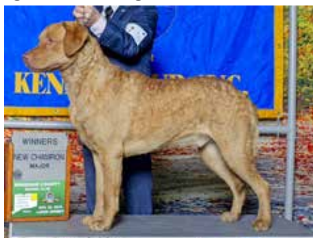
“Sailor” CH Bay Haven’s Red Sky At Night Sailor’s Delight, CGC