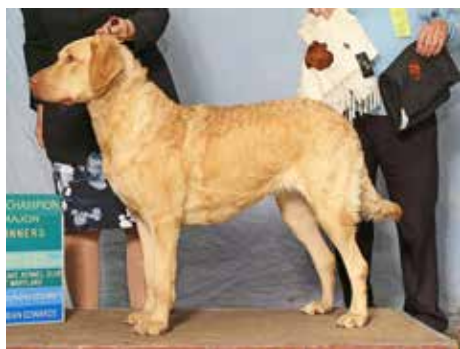
“Daisy” CH Eastern Waters’ Sacagawea