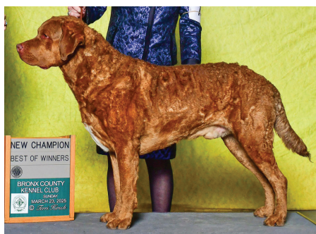
"Tucker" CH Redlion's Tucker II, JH