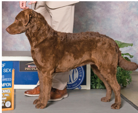
"Mint" CH Del Brave Penny Bank